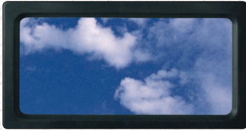
12 x 24